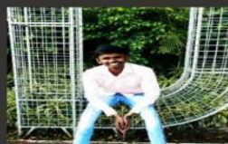
VISHNU MANAGEMENT HEAD